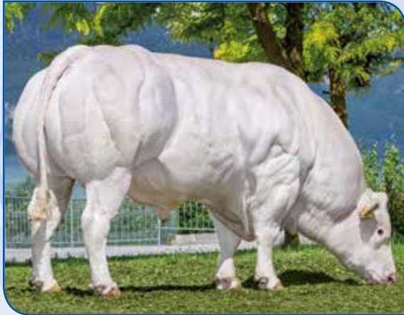
Huge bull 1240 Kg of weight. Wide spread used and calves reach high market values.

BE000426893302 Born 04.13.2010 Cubitus x Paisant