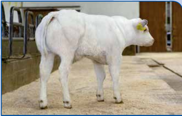
Vitello da incrocio con tori Superblu