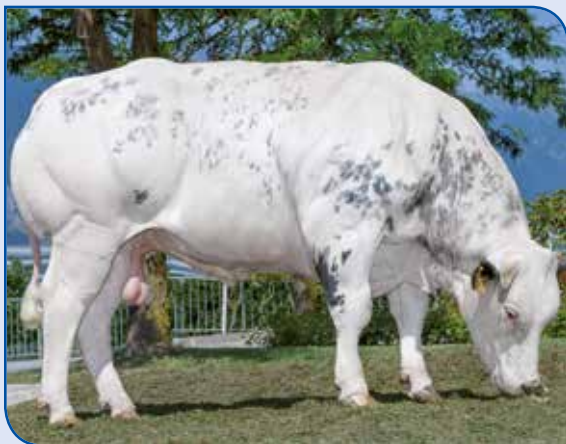
This bull has grey hair. Tall and massive. His calves bring high values on the market.

BE000051780834 Born 09.29.2014 Benhur x Harrison