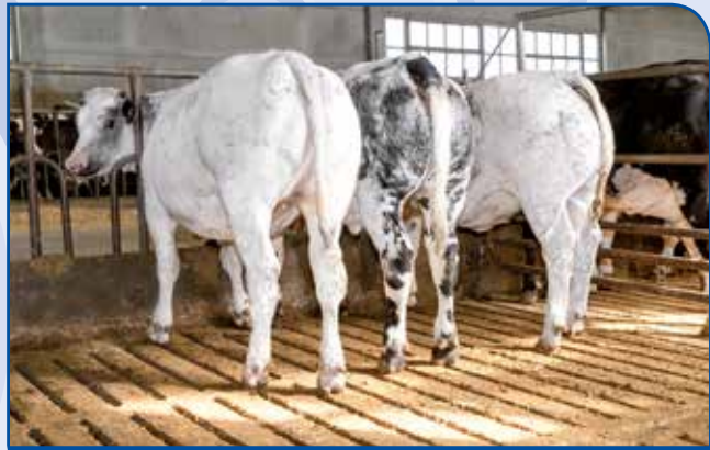
Manze da incrocio con tori Superblu